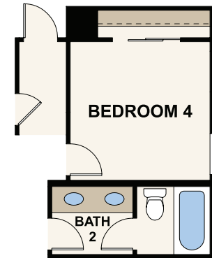
OPTIONAL BEDROOM 4